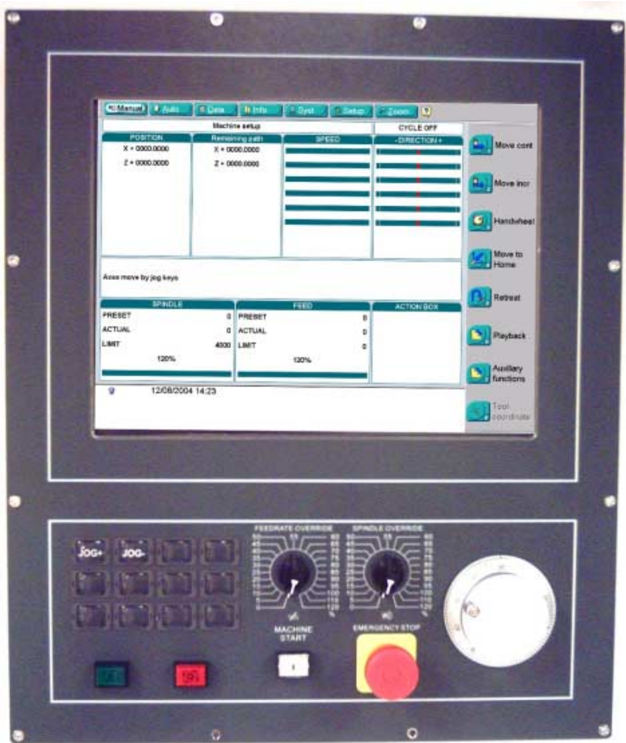
M267 Front view