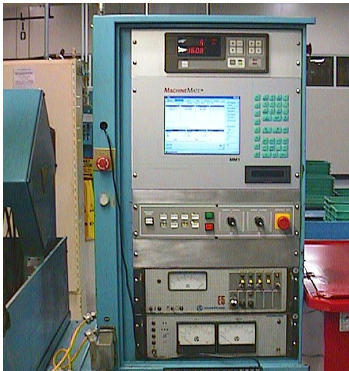
MACHINEMATE CNC and Machine Tool Builders Panel retrofit into old cabinet

The MACHINEMATE control was mounted in the existing cabinet with the other grinder electronics. This cabinet is shown below.